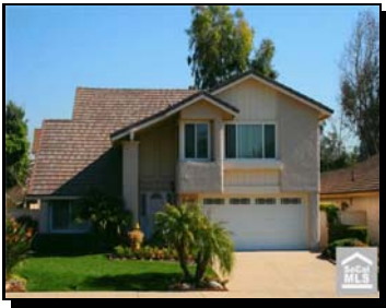
Seller was relocated.

Beautiful, Nicely Upgraded Home in Lake Forest! Property has Grand Double Door Entry, Marble Foyer and Hardwood Flooring in the Living and Dining Room Areas. Kitchen has Been Upgraded with Granite Counters and Nice Cabinetry. Backyard is a Peaceful Garden Retreat Complete with Fountain and Koi Pond. The Bonus Room Upstairs is Perfect for Entertaining with its Built in Solid Wood