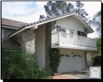
Bank owned - previously sold for $785K in July 2005

Address: 25281 Calle Busca Sold 8/12/2008