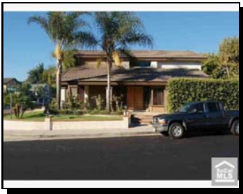
Short sale - erroneously reported as closed in April - last sale was for $860K in July 2006.

Upgraded Home At the End of a Cul-De-Sac! Flag Lot and Spacious Tri-Level Floor Plan with Vaulted Ceilings. Double Door Entry, Newer Windows and French Doors. Wood Floors and a Large Yard with a Pool and Spa. Family Room with Wood Burning Fireplcae and Bar. Large Formal Dining Room and Livingroom on Different Levels to Add Ambiance. Low Taxes.. . No Mello Roos. Sun and Sail Club