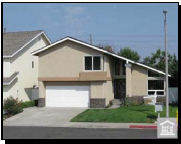
This is a "green remodel." Very pretty, and should provide energy savings but buyers don't seem willing to pay extra for the green features.

Fantastic Value on this Story Pool Home Located in Quiet Interior Tract Location. Tiled Entry, Formal Living Room and Dining Rooms with Plantation Shutters, Separate Family Room with Fireplace, One Bedroom/Den and Bathroom Downstairs, Super Spacious Master Suite, Fresh Two Tone Interior Paint, New Upgraded Carpet, New Kitchen, Pantry and Family Room Built-In Cabinet Doors, New Furnace, 2 Car