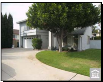
MLS shows 2 days on the market but the sellers actually received their offer on the very first day, within 5 hours of going on the MLS.

This Home is Beautiful and Ready to Move! Large Pool Size Backyard! Upgrades Were Recently Done: Dual Pane Magic Windows (When Window is Opened the Screen Comes Out)-Almost New Roof-Recessed Lights-Plantation Shutters-Ceiling Fans in all Bedrooms-New Master Bathroom Vanity with Granite Countertops-Stainless Steel Kitchen Appliances-Scraped Ceilings-Custom Painting-Large Patio Cover In