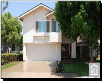
*Short sale - successfully closed.

Address: 24453 Via Secreto Sold 3/7/2008